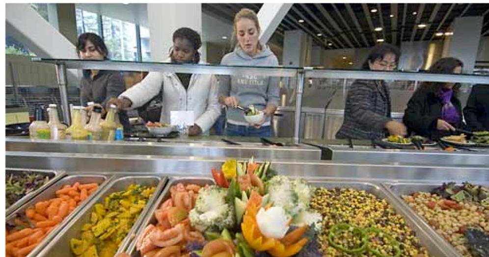
Berkeley students and staff fill their bowls with organic fixings from the new all-organic salad bar at the Crossroads dining complex.